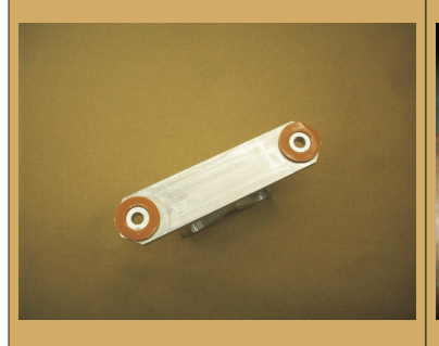
Install the shifter bracket cover.