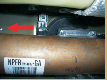
Push the shifter assembly up and align the mounting studs. Secure the bracket to the body.