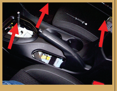
Pull the right side of the trim out to gain the access to the screw holding the center console's side trim.