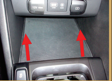
Remove the screws securing the center console.