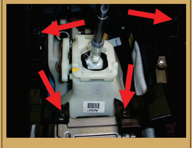
Remove the screw holding the center console.