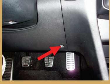
Remove the right side clip.