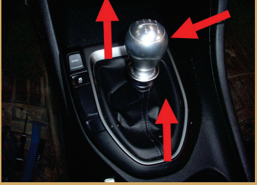
Remove the center console bolts.